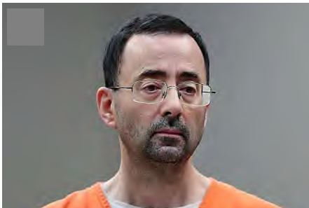
Larry Nassar: Disgraced sports coach who sexually assaulted Olympic gymnasts stabbed...

Natalie Suleman gave birth to the world's first surviving octuplets, but their amazing story didn't end after her famous... Buzzerilla