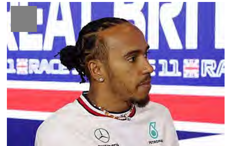
Lewis Hamilton admits Mercedes confusion at British Grand Prix after disappointing Friday at...