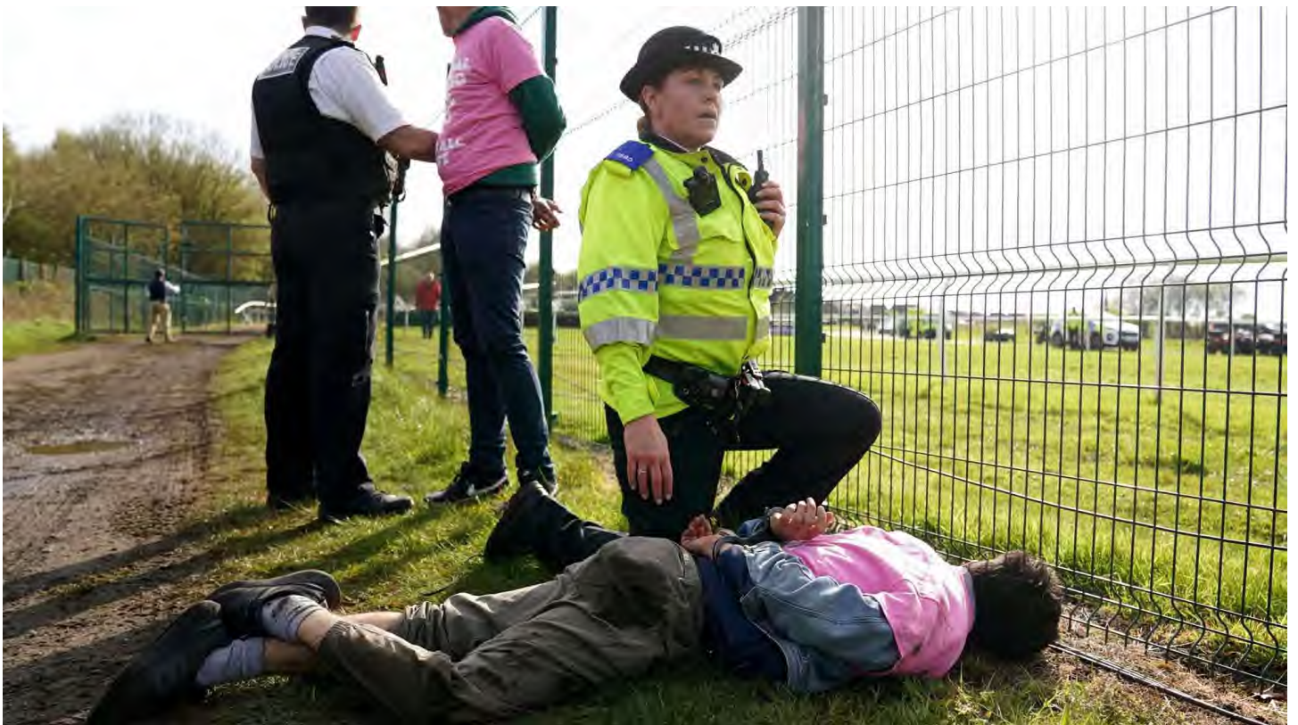
A protester, wearing a pink T-shirt of the Animal Rising group, is stopped by police at Aintree