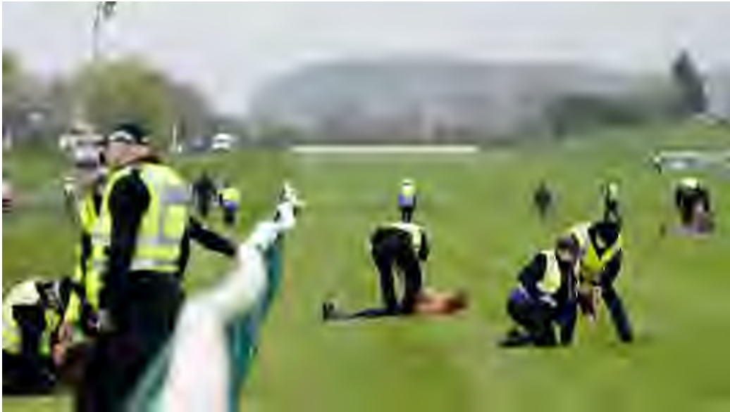
Protestors on the track at Ayr ahead of the Scottish Grand National

"Animal Rising have repeatedly made it explicitly clear that they intend to break the law and disrupt The Derby Festival and that left us with no choice but to seek this injunction, having consulted with a number of stakeholders including Surrey Police.