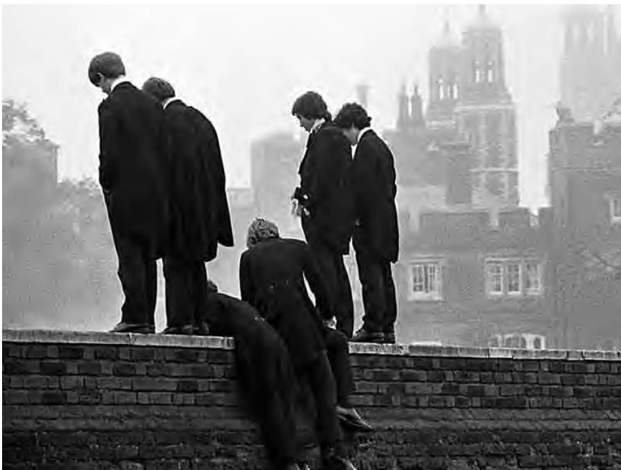
The backlash against Britain's boarding schools