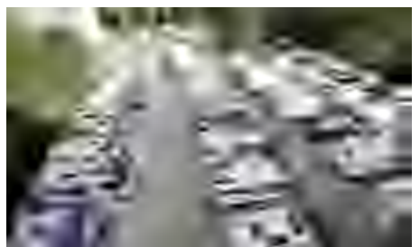
Unsold Campers Are Being Sold For Almost Nothing