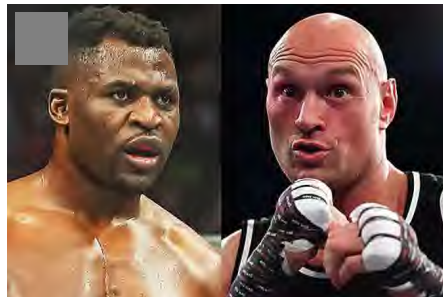
Tyson Fury confirms next fight against former UFC champion Francis Ngannou in Saudi Arabi...