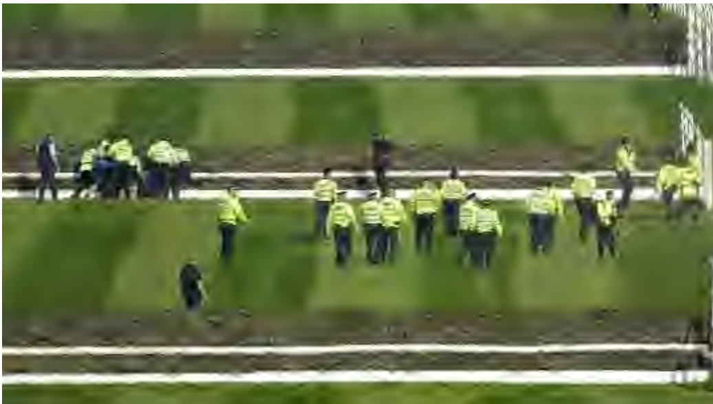
Police officers respond to Animal Rising activists attempting to invade the racecourse ahead of the Randox Grand National at Ascot

Epsom officials on alert for possible Derby protests