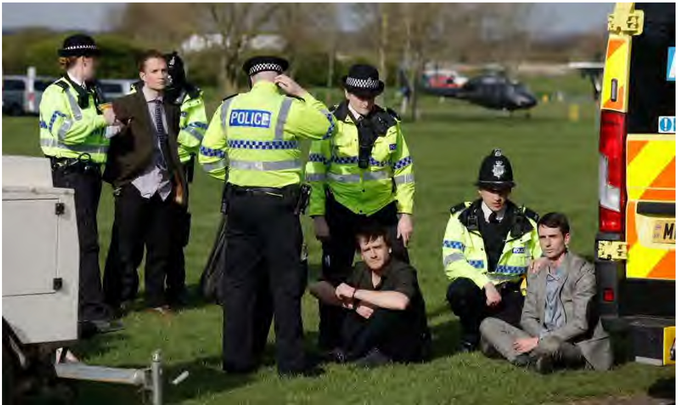
📷 Animal rights protesters arrested at the Grand National.